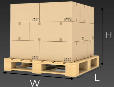
Standard Pallet Dimensions Width: 54" Length: 54" Height: 77"

GUARDIAN CAN INSPECT AND OUTPUT TO YOUR LINE PLC WHENEVER A DEFECTIVE PALLET LOAD IS FOUND ALLOWING OPERATORS TO CORRECT THE PROBLEM BEFORE IT CAUSES A CRASH.